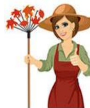
RAKE YOUR YARD