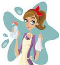
TIDYING AND CLEANING THE HOUSE

PRACTICAL EXAMPLE: Things we do at home to help and show care.