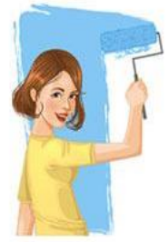
PAINT A ROOM