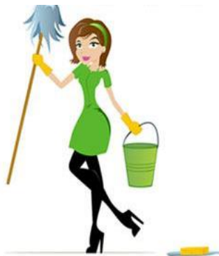
SWEEPING AND MOPPING THE FLOOR